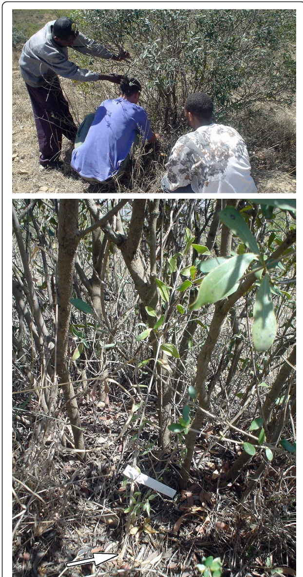
Figure 1 Seedling planting and ecological forest restoration. Planting late-successional tree species under early-successional shrubs can be an effective means of restoring forests under high abiotic stress. Tree planting under facilitating nurse shrubs is a typical example of the community approach to forest restoration. This figure shows the planting of an African wild olive seedling ( Olea europaea ssp. cuspidata ) under the canopy of Euclea racemosa rather than in the open space between the present shrubs. See [43] for details. Tsegaye Gebremariam, Raf Aerts and Bisrat Haile agreed to be photographed in the field.

overcome seed limitation) has been found effective for the restoration of highly complex forest on bauxite mined sites, but only after careful site preparation and topsoil handling or replacement (interventions to overcome survival limitation caused by soil compaction, decreased soil porosity and infiltration capacity, and the loss of soil biota) [47,48].