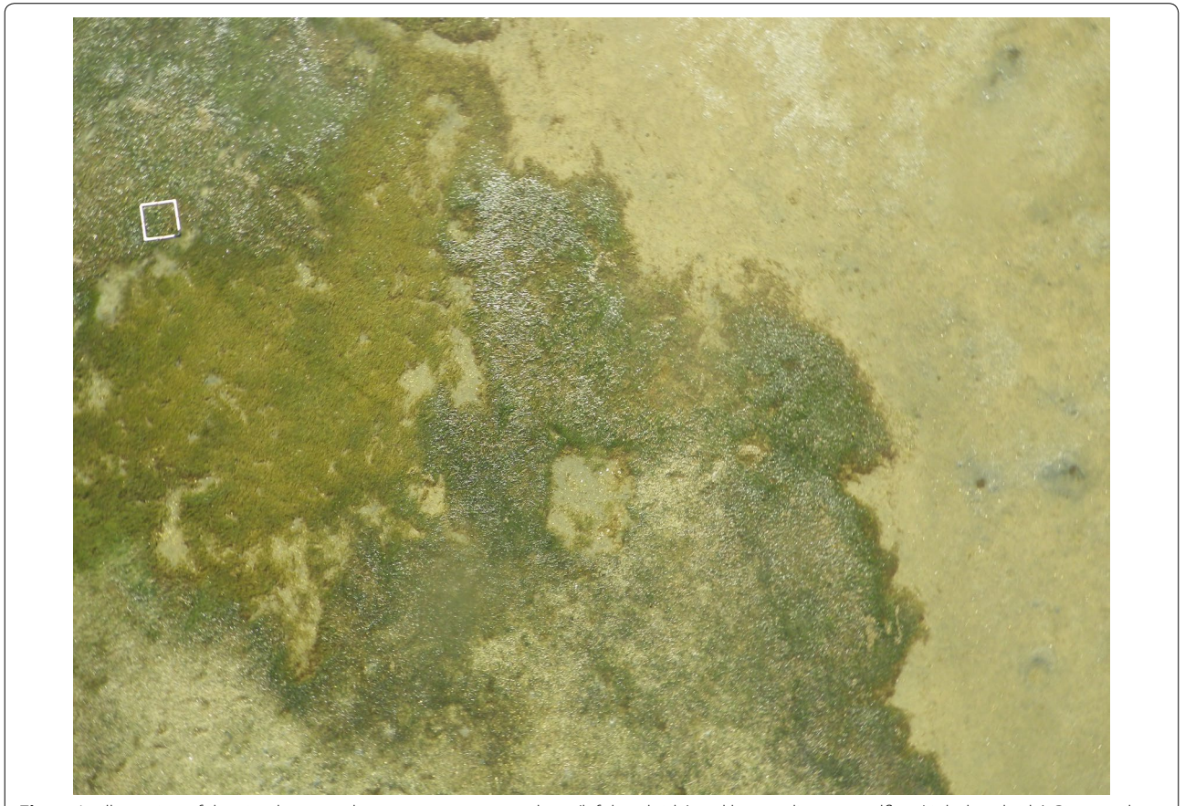
Fig. 1 An illustration of the visual contrast between seagrass meadows (left hand side) and bare sediment sandflats (right hand side). Picture taken by Roman Zajac at Kaipara harbour, New Zealand. The white rectangle encompasses 0.5 \times 0.5 m